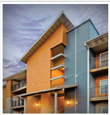
eko Park | Springfield, Missouri

An achievement built on connections between neighbors, bonds between friends, trust between partners, and pride in where you live.