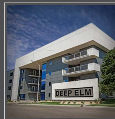
Deep Elm | Springfield, Missouri >

When that growth is coupled with ambition and the ability to see it through, flourishing is inevitable.